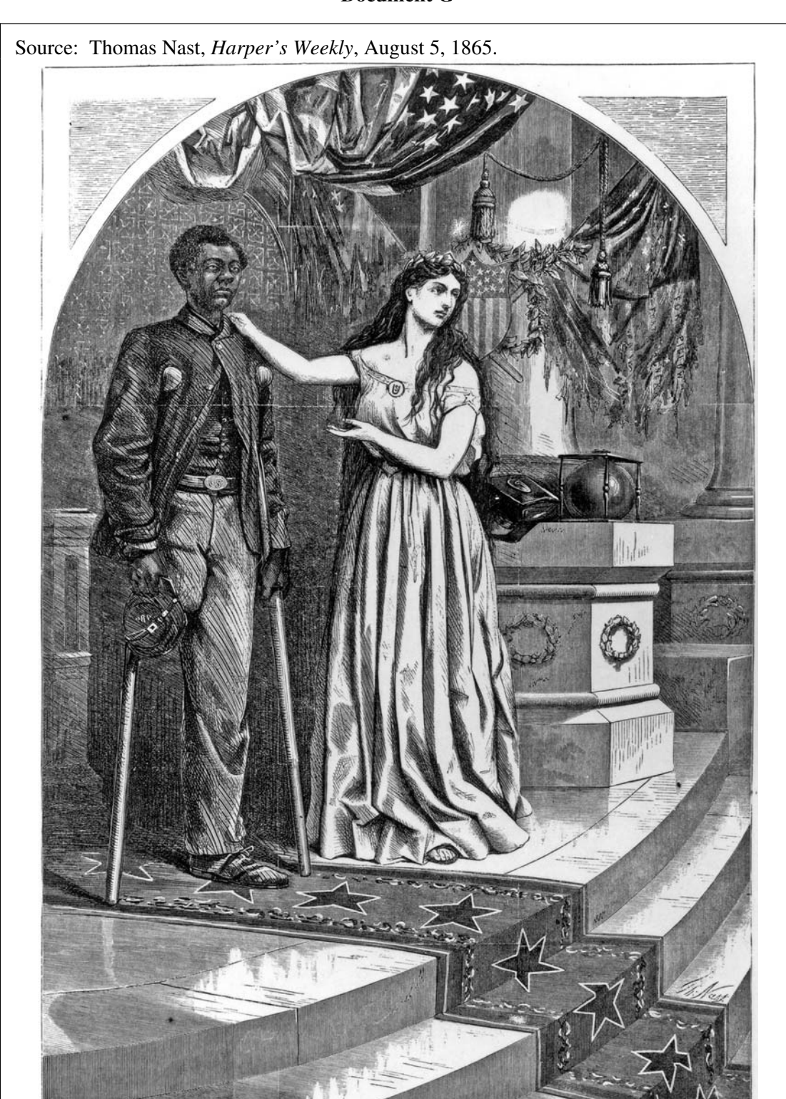
"And Not This Man?"